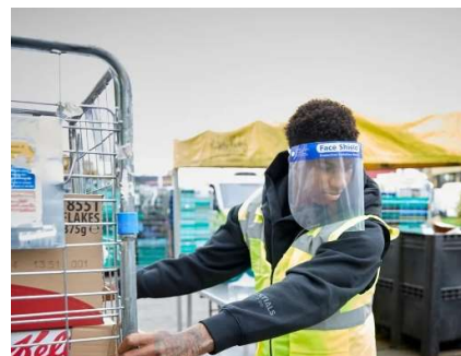
Marcus Rashford promoted and worked with FareShare to distribute over 21 million meals for vulnerable children and families

A lot of blame is also being placed on the strains of lockdown, which without a doubt was a difficult time for all, yet when it hit: communities came together along with celebrity and footballer, Marcus Rashford and supplied meals for vulnerable children. Despite children being able to eat being an important issue, one that many people were grateful for, for being aided so quickly, why was domestic/child abuse not thought about when there was already a 'jump on the bandwagon' for economically vulnerable children?