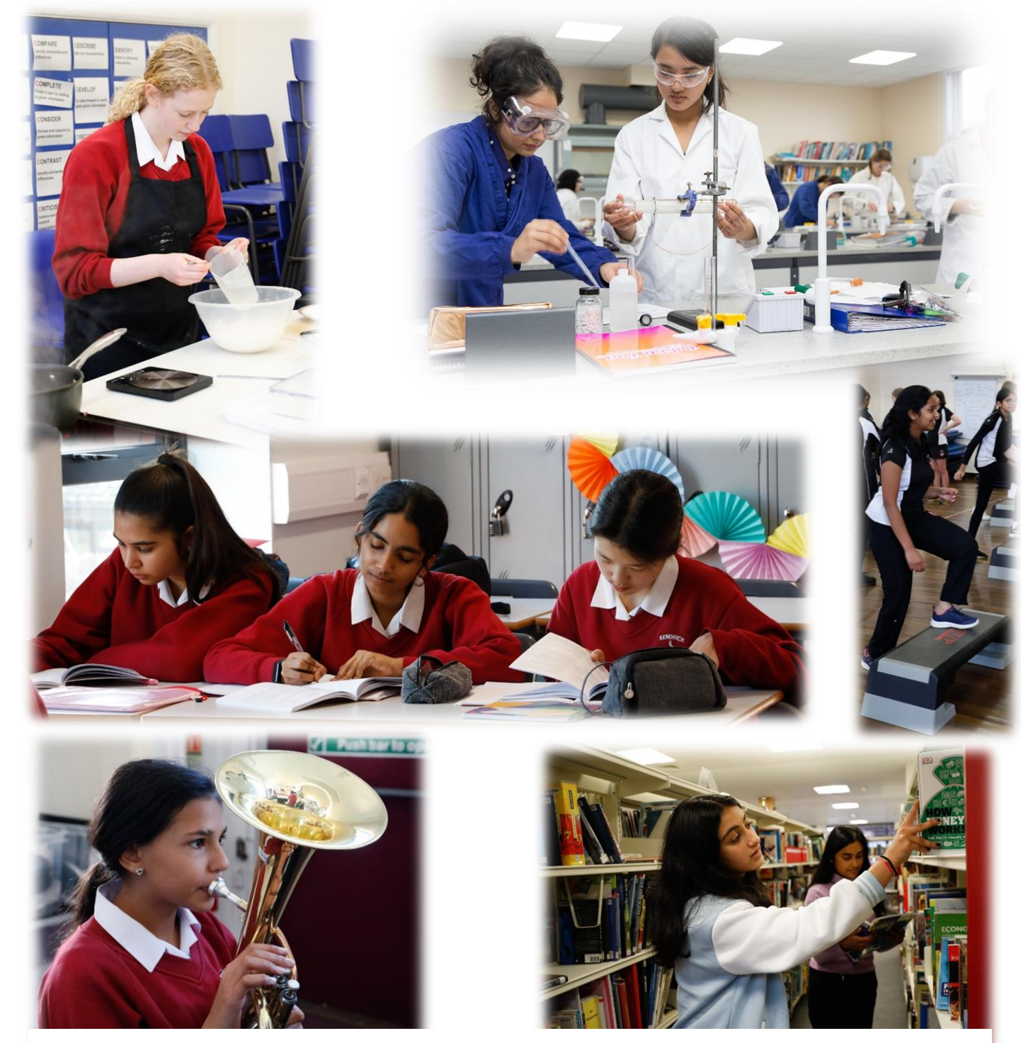
Lead, Inspire, Make a Difference